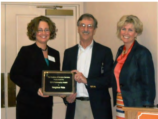
Coalition of Geriatric Services Partnership Award