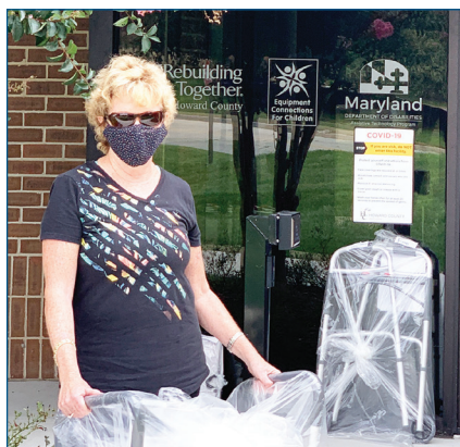
Neighbor Ride’s volunteers are now delivering durable medical equipment in partnership with The Loan Closet.

As Neighbor Ride expands its services to respond to the needs of the most vulnerable in our community during the pandemic, your support of our Annual Giving Campaign is more important than ever. Please consider giving online at neighborride.org or via check to: Neighbor Ride - 5570 Sterrett Place, Suite 102 – Columbia, MD 21044.